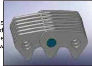
圆销式静音链 Round pin type silent chains

Round pin type silent chain is mainly used for transfer case and gearbox as system, which is the core component of the drive system. The chain is made of superior quality steel and the plates of which are austempered, which is especially suitable for various conditions such as high strength, high wear resistance, low noise and big torque etc..